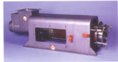
722 Centrifugal Sifter

Demerara Sugar Stearate Casein Resins Detergent Powders Phosphates Petfoods